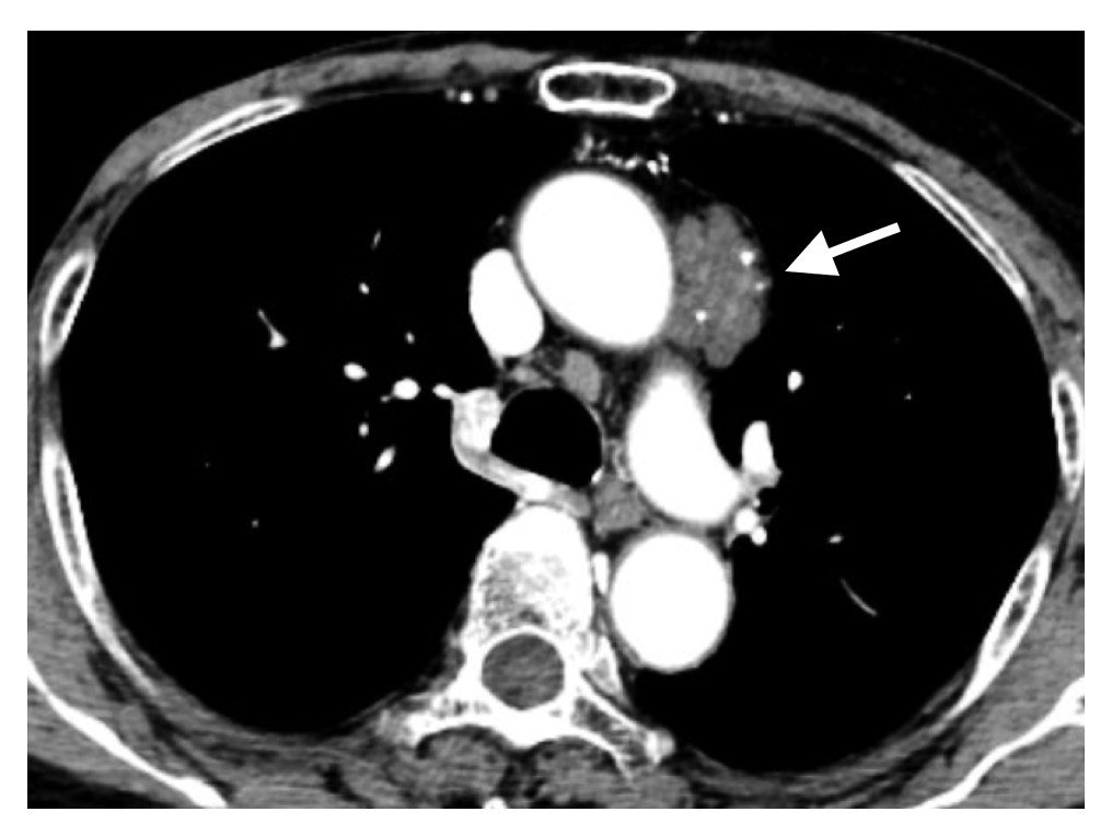
Fig. 1 Contrast-enhanced computed tomography scan showing a lobulated tumor with slight heterogeneous enhancement and calcifications in the left side of the anterior mediastinum (arrow).

We then used three ports at the third and fifth intercostal spaces of the left anterior axillary line, and the sixth intercostal space of the left anterior axillary or midclavicular line. The tumor had a hypervascular appearance and showed no invasion of surrounding tissues and great vessels. Microscopically, several dilated vessels were covered with normal endothelial and smooth muscle cells, and some fibrin thrombi and phleboliths were observed (Fig. 3). The pathological diagnosis was mediastinal venous hemangioma. The patient has been recurrence-free for 2 years postoperatively.