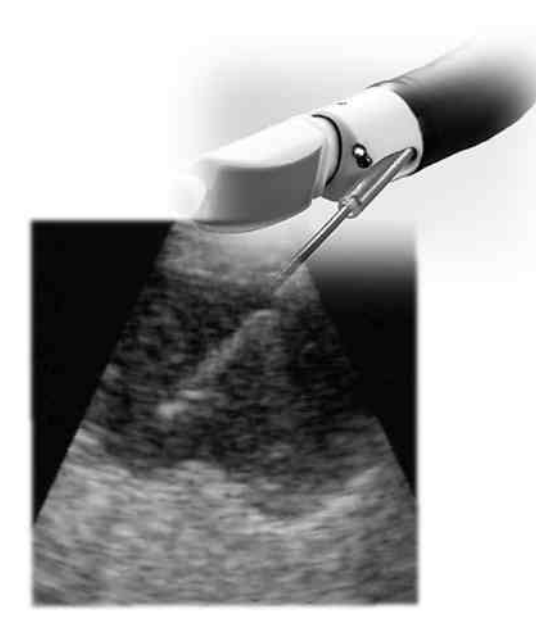
Fig. 1 Schematic sampling image of EBUS-TBNA Peribronchial tissue is directly sampled.

needle using a wire stylet included with the needle kit. In addition, we made cell-block preparations from the beginning of 2011. In our institute, if visible aspirated material was pushing out into the normal saline, the sample was picked up and prepared for histological analysis (i.e. paraffin embedded specimen), then the residual pieces of tissue and cells were centrifuged and made into a cell-block sample. The residual specimens in the needle were sprayed by a syringe onto slides for cytological analysis and fixed with 95 % ethanol.